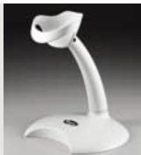
> AS-8000 stand