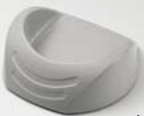
> AS-8000 holder