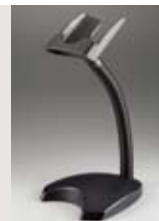
> AS-8120 stand